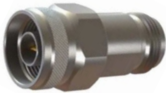
N P to J