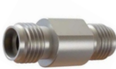
3.5mm J to J